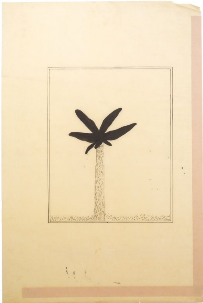
No. 1. Original drawing in black ink; (sheet size 780 × 510 mm).