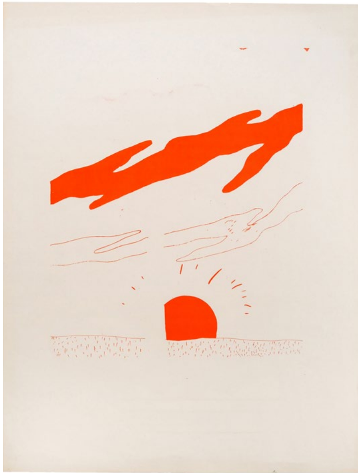
No. 3. Proof in red of the second screen; (sheet size: 570 × 448 mm).