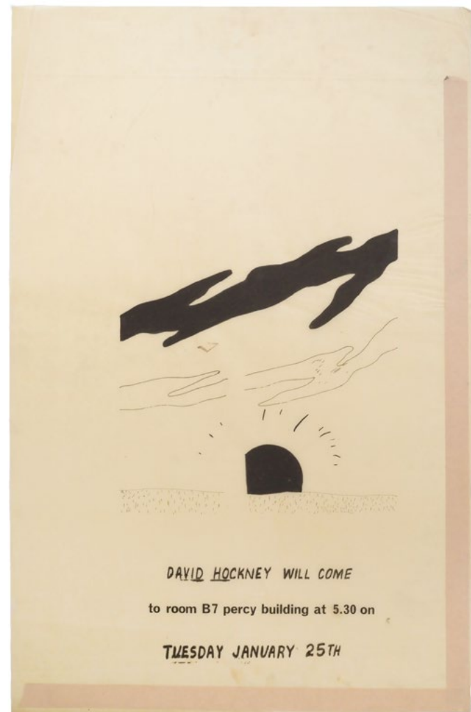
No. 2. Original drawing in black ink; (sheet size: 780 × 510 mm).