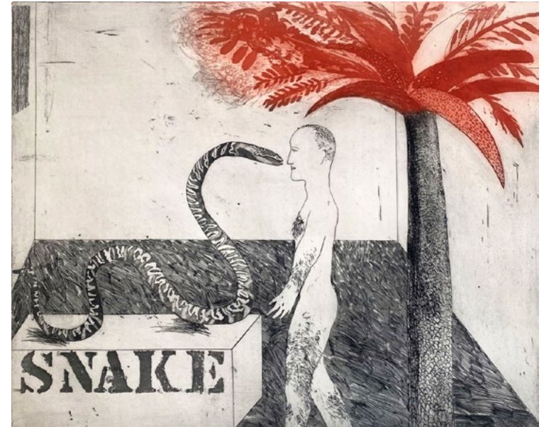
(Right): David Hockney, Jungle Boy , Etching and aquatint, 1964